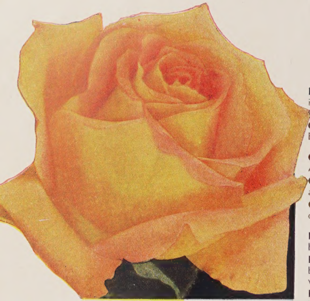
McGREY'S SUNSET (Plant Patent No. 317)